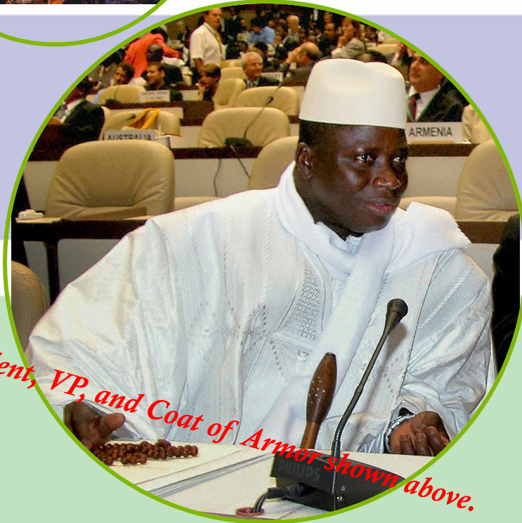
President, VP, and Coat of Armor shown above.